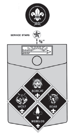
WEBELOS SCOUT LEFT POCKET (BLUE OR TAN SHIRT)