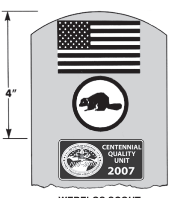
WEBELOS SCOUT RIGHT SLEEVE